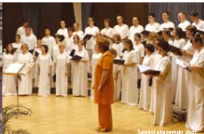
Šaleški akademski zbor