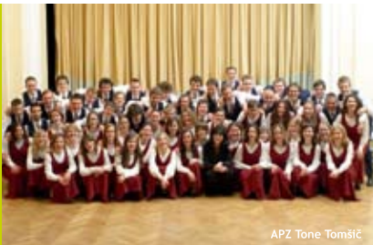
APZ Tone Tomšič

Academic choir with an 80-year tradition. Programme orientation: contemporary compositions and première performances