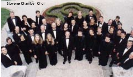
Slovene Chamber Choir